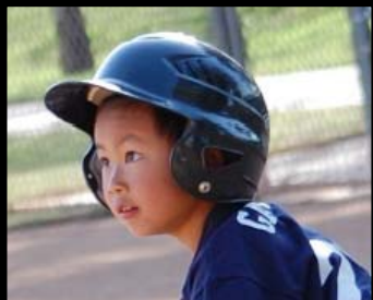
#28 PLAYER'S NAME