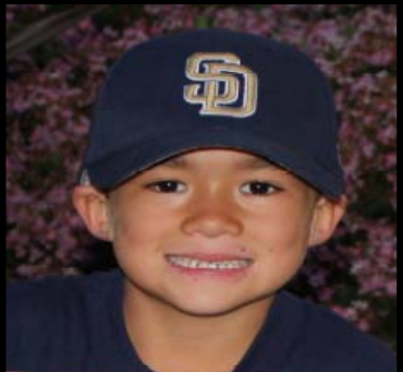
#14 PLAYER'S NAME

DIVISION - TEAM NAME Head Coach: NAME Assistant Coaches: NAME(S) Team Mom: NAME