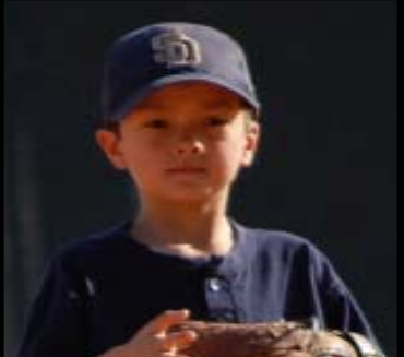
#1 PLAYER'S NAME

2009 IRVINE PONY BASEBALL Machine Pitch Padres