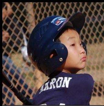
#61 PLAYER'S NAME