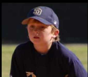
#99 PLAYER'S NAME