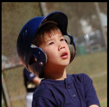
#2 PLAYER'S NAME