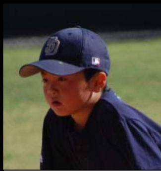
#18 PLAYER'S NAME