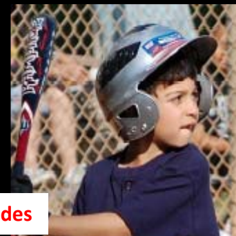
#8 PLAYER'S NAME