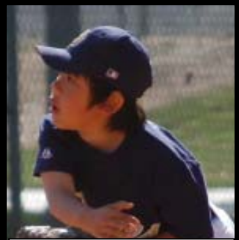
#27 PLAYER'S NAME