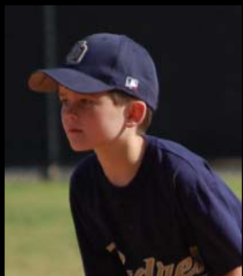
#88 PLAYER'S NAME