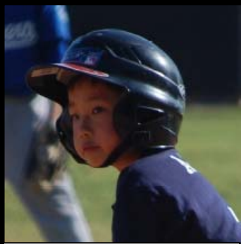
#9 PLAYER'S NAME