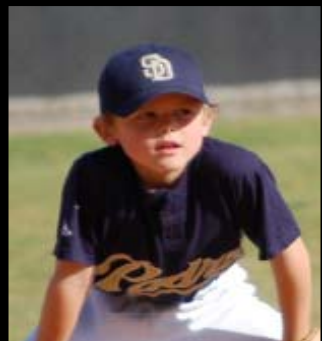
#7 PLAYER'S NAME